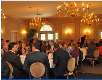
The 8th Annual Economic Development Awards Luncheon.