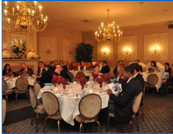
Guests at the Lafayette House for the 8th Annual Economic Development Awards Luncheon.